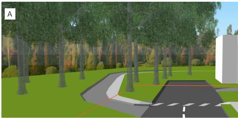
ADA Sidewalk added next to Boat Ramp