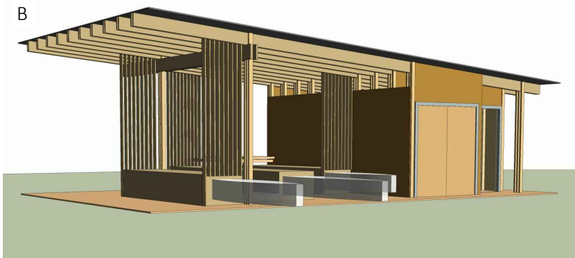
Multipurpose Rec Building designed by UMass Architecture team