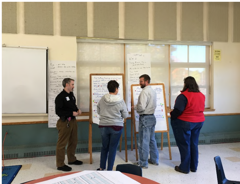
Sunderland MVP workshop participants identifying and prioritizing top hazards.

Location of Critical Facilities and Limited Emergency Access Routes: Participants raised several concerns with regard to the Town's critical facilities and evacuation options. The primary concern is with the loss or closure of the Sunderland Route 116 Bridge over the Connecticut River. When the Sunderland Bridge closes, all westward evacuation options are lost, including the closest access to I-91. The majority of residents must rely on Routes 47 and 116, as there are very few backroads throughout Sunderland that could be used during an emergency.