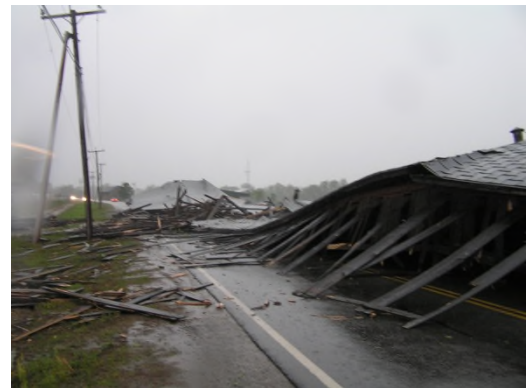
A 2009 "gustnado" destroyed tobacco barns in Sunderland along Route 47.