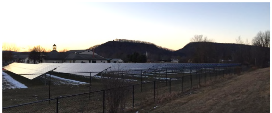
The solar array adjacent to the Sunderland Elementary School.

Diverse Natural Resources: Workshop participants noted that there are many protected open spaces throughout the town. Sunderland is