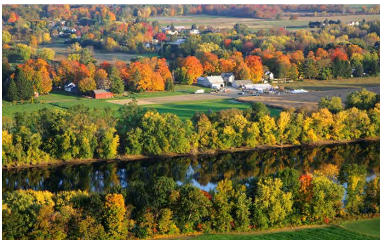
Farms in Sunderland play an important role in the community, providing local food, jobs, and agri-tourism.

Impacts of Flooding and Drought on Farms and Residences: The flat low-lying area in Sunderland has drainage